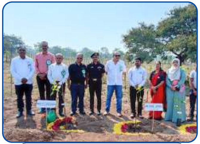
Cosmo Foundation & Prayas Youth Foundation Team at Bio Diversity Hub