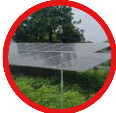
Solar Energy for Paper Mill