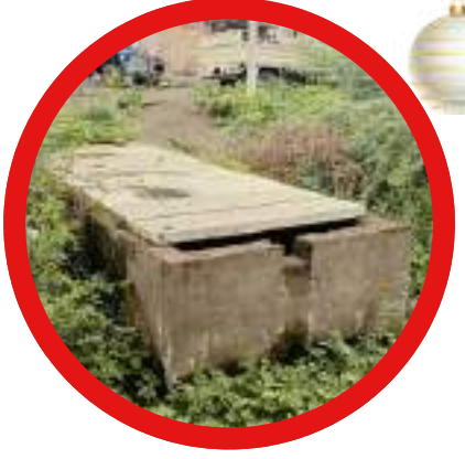
STP for Cleanliness & Pond Water