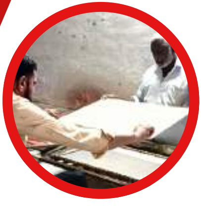
Support to Hand-Made Paper Mill