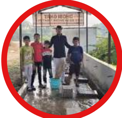
Cleanliness Drive-Dhobi Ghaat