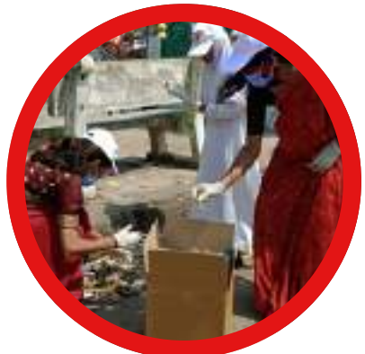
Plastic Waste Collection Campaign