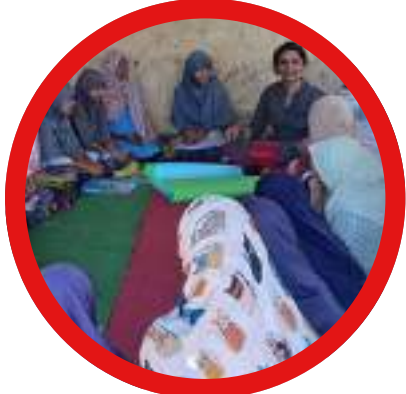
Workshop with Students