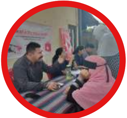
Health Check-up Women