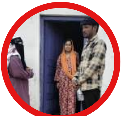
Home-site Community Contact