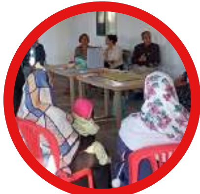
Dialogue with Women